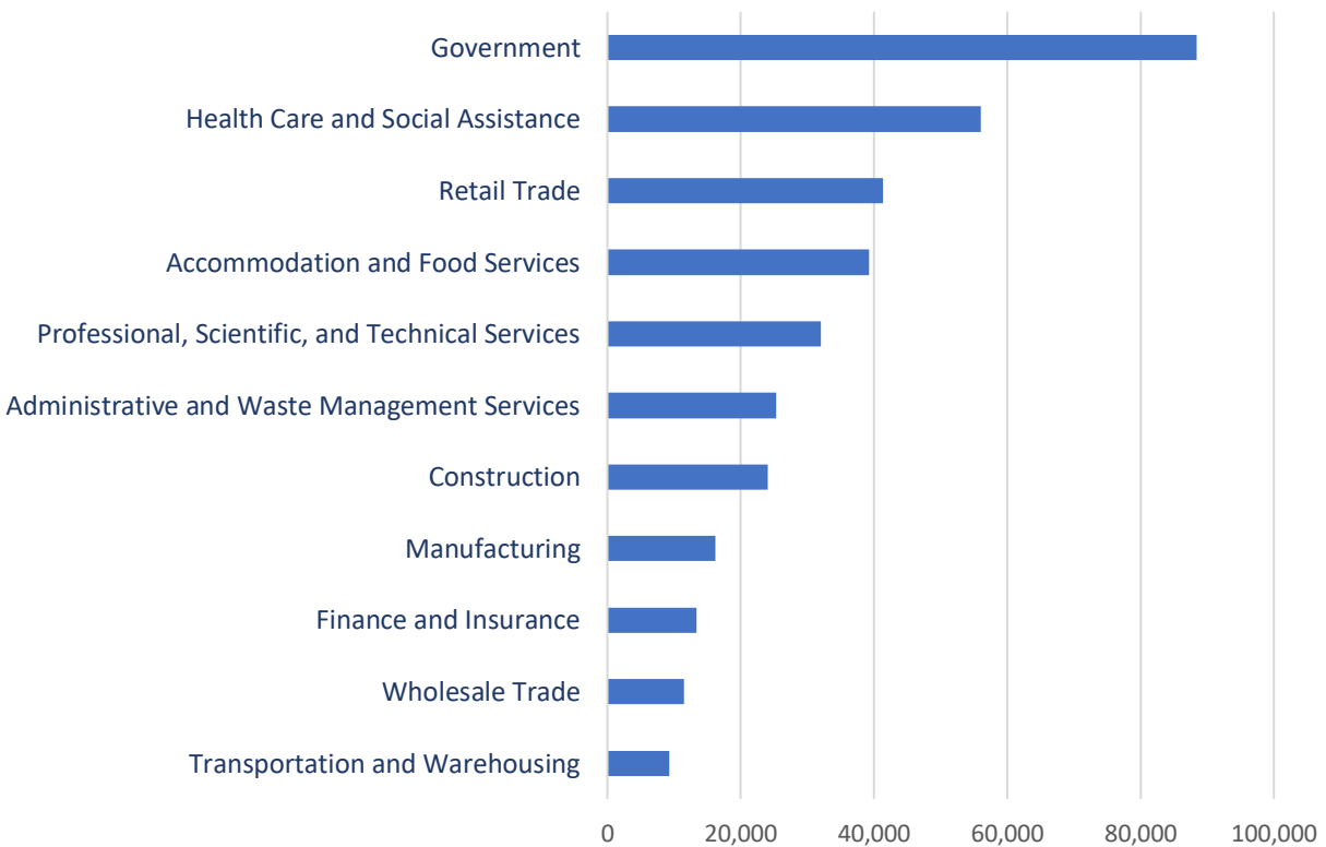
Employment, Top Industry Sectors, Region E

An Employment Location Quotient is an indexed value that illustrates the concentration of an industry in a particular location. An LQ of 1.0 indicates that employment in the target industry is exactly equal to the national average. An LQ of 2.0 indicates that industry employment is double the national rate.